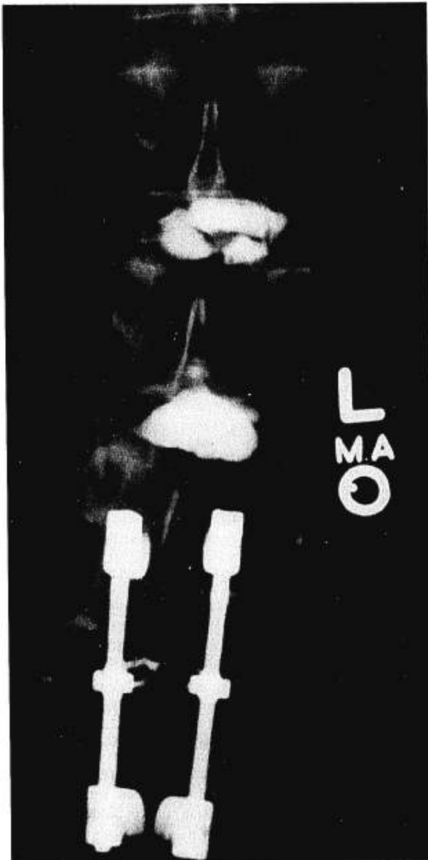
Fig 2. End-plate disruption at the level above a Knodt rod fusion. The contrast material leaked into the vertebral body above the injected disc.

of the fetuses and infants. In adult specimens, fine free nerve fibers were observed in all anatomic locations in the vertebra, except in the deeper zones of the annulus or in the nucleus pulposus.